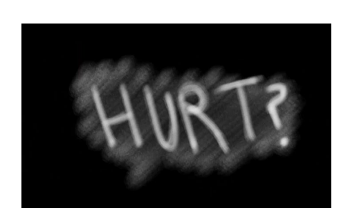
1<sup>ST</sup> PLACE AND FAN FAVORITE: "LOVE SHOULD NEVER HURT"

For the twelfth consecutive year, the DVCC coordinated a Public Service Announcement (PSA) Video Contest for local teens in middle and high school. This contest raises teens' awareness on the issue of teen dating violence, both through the creation of the PSAs, as well as the distribution of the finished PSAs on social media, YouTube, and in schools. Participants were challenged to create a 60-second video addressing either physical abuse, emotional/verbal abuse, types of technological abuse,